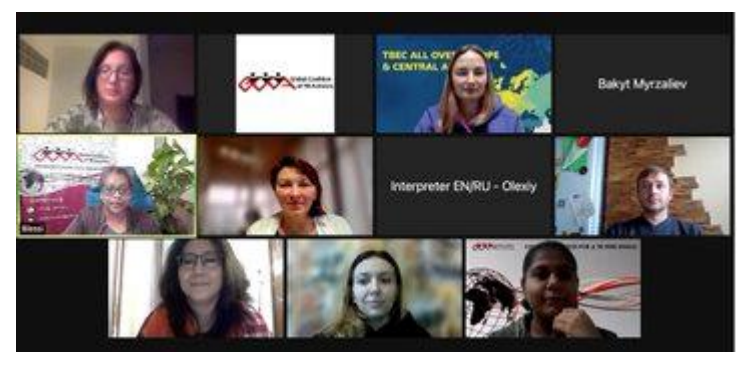
Eastern Europe and Central Asia Regional Consultation

Another reason for challenges with registration is the lack of updated auidelines. Participants from Perú described that while Perú has made some progress with MDR-TB, it remains the country with the highest MDR-TB rates in the continent. And while in 2014, with effort from local much TB organizations and community groups, the Law for TB Control and Prevention (Law 302) was enacted rights to set out of and