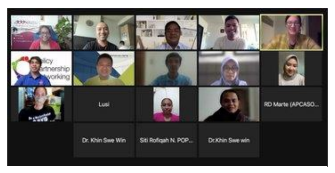
Asia Pacific Regional Consultation

A second theme of concern evolved of around the nexus national healthcare systems, TB treatment and TB diagnostics. In several instances, participants expressed serious concern about the continued unavailability or severely limited availability of safe, short oral regiments rather than the injectable regimens which have long been recognized for their serious side effects. Injectable regimes have been