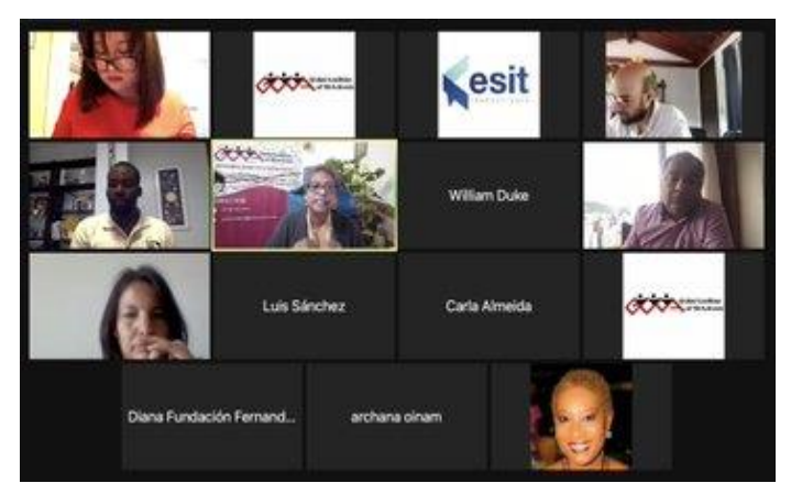
LAC Regional Consultation

Other participants spoke of similar sentiments of lagging implementation of new policies, non-commitment to structural change, and in some cases outright hostility towards civil society were voiced from all regions. In some countries, operating a community organization is a challenge in itself. As documented has been widely elsewhere, governments often restrict citizens' freedoms of assembly and association, i.e., their ability to come together, to organize, and to form sustainable organizations. While a